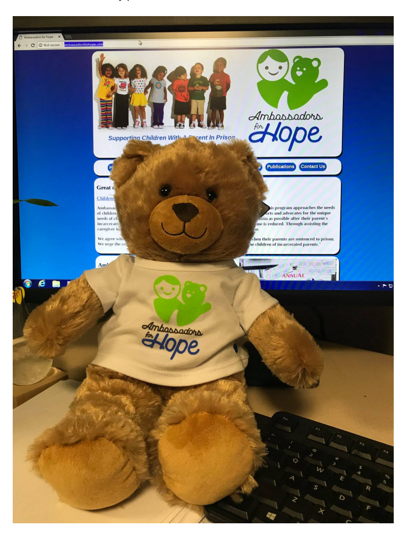
Photo: Ambassadors for Hope bear given to children with a parent in prison.